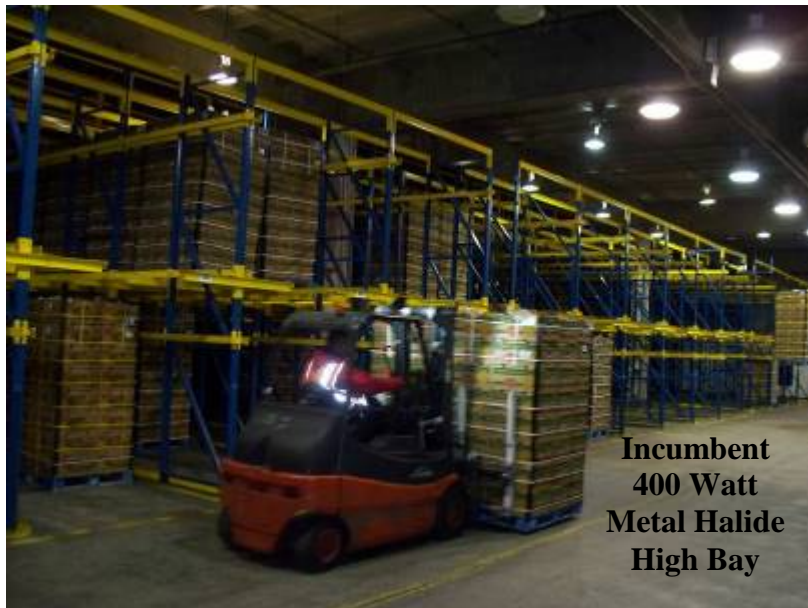
Incumbent 400 Watt Metal Halide High Bay

Similar facilities that install LED Light Technology’s Intelligent LED Lighting System will obtain an estimated $132,225.00 in annual energy savings, which equates to removing 68 cars from the road and planting 9,213 trees every year. Candidates for this system will recoup their investment within one to two years and will benefit from years of maintenance-free use and measurable validation of their investment.